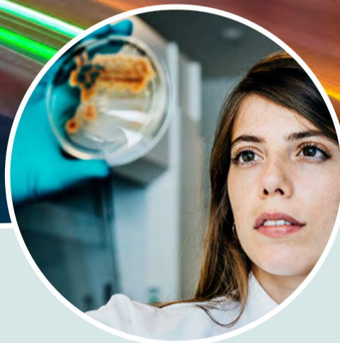
Novo Nordisk Foundation Center for Biosustainability