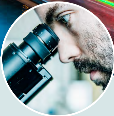
Novo Nordisk Foundation Danish Stem Cell Center