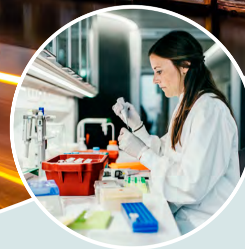
Novo Nordisk Foundation Center for Basic Metabolic Research

Recruiting 16 motivated students from around the world to join a fully funded four year PhD programme in an international scientific environment at one of the Novo Nordisk Foundation Research Centers. Positions starting September 2019.